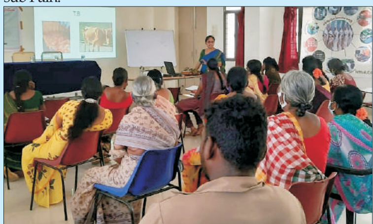
Training Programme on Punaruthpathi Sambandita Zoonotic Vyadulu Mariyu Nivarana Charyalu

Dept of Veterinary Public Health and Epidemology – Conducted one day Training programme on Punaruthpathi Sambandita Zoonotic Vyadulu Mariyu Nivarana Charyalu" with 30 SC & ST women Farmers around Proddatur mandal villages on 26.03.2022 under SC sub Paln.