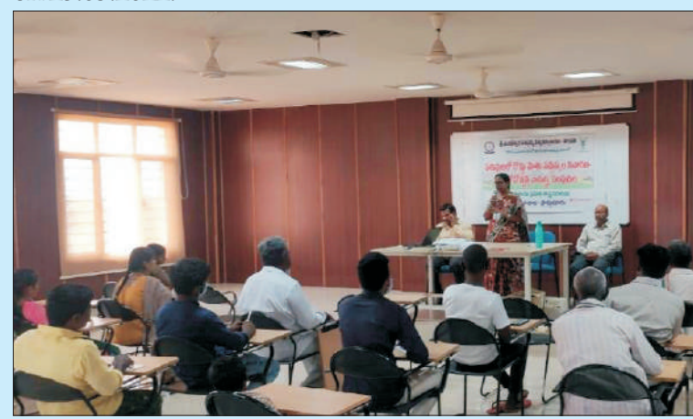
Training Programme on Pashuvulalo Goddu Mothu Samasyalu Nivarana

Dept of Veterinary Gynaecology and Obstretics – Conducted one day Training programme on 'Pashuvulalo Goddu Mothu Samasyalu Nivarana, Santhanothpathi Samarthyam pempudala" with 38 SC & ST Women Farmers around Proddatur mandal villages on 25.03.2022.