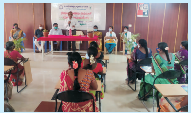
Training Programme on Paadi Pashuvulu mariyu Jeevalalo Tarachuga Vache Vyadulu mariyu Vaati Nivarana Charyalu

Dept of Veterinary Medicine – Conducted training programme on 'Paadi Pashuvulu mariyu Jeevalalo Tarachuga Vache Vyadulu mariyu Vaati Nivarana Charyalu" with 35 Farmers around proddatur mandal villages on 24.02.2022 under SC Sub Paln.