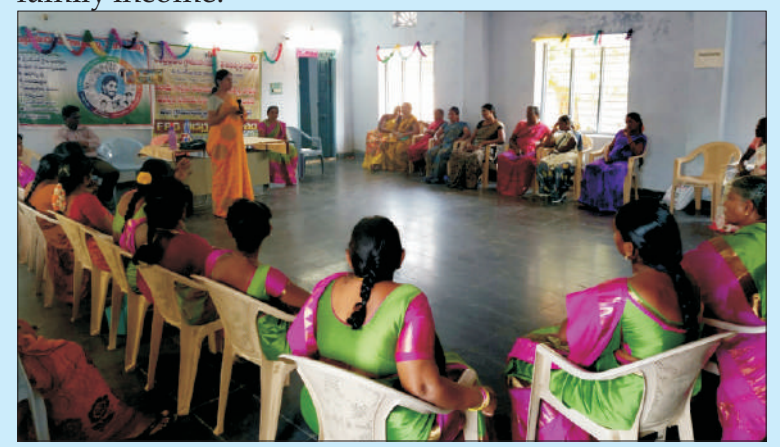
Training Programme on Clean Milk Production

Training programs (13) were carried out at KVK Guntur on crop residue management in chilli, nutrient management in paddy, prevention of anemia, IPM in chilli, ICM in Bengal gram, IPM in sesame, Rearing of Rajasri chicks and capacity building training program on clean milk production, bee keeping as business model for rural youth, Post harvest management, low cost nutritious food for children, skill training on mushroom production, capacity building of farmers through strategies a year calf programme for more income for the benefit of rural farmers strengthen their family income.