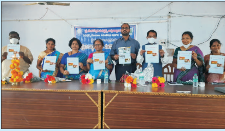
Training Programme on Sastreeya Paddathilo Padipasuvula Poshana

Department of Animal Nutrition organized one day training programmes on "Sastreeya Paddathilo Padipasuvula Poshana" and "Upadhi Kalpanalo Pasu Sambandha parisramalu" on 12-01-2022 and 13-01-2022 respectively to benefit of the farmers.