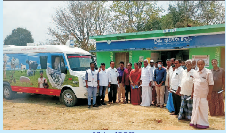
Visit of RBK

March 2022, (07) field visits were carried out to RBKs Settigunta, Rly. Kodur (M), RBK Nagavaram, Chitvel (M) of YSR Kadapa district, Kammapalli, RBK Pantapalli, Pakala (M), RBK Kamalayyavaripalli, Y.V.Palem (M), RBK Thippireddygaripalli, Chinnagottigallu (M) of Chittoor District and RBK Siddavaram, Venkatagiri (M) of SPSR Nellore districts.