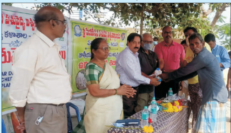
NSS Programme at Kayampeta Village

NSS programme was conducted by CVSc, Tirupati with the help of CCVEC on 19-02-2022 at Kayampeta village and the first year postgraduate students of the department of VMC and final year BVSc & AH students and teaching staff has attended the camp and collected necessary samples.